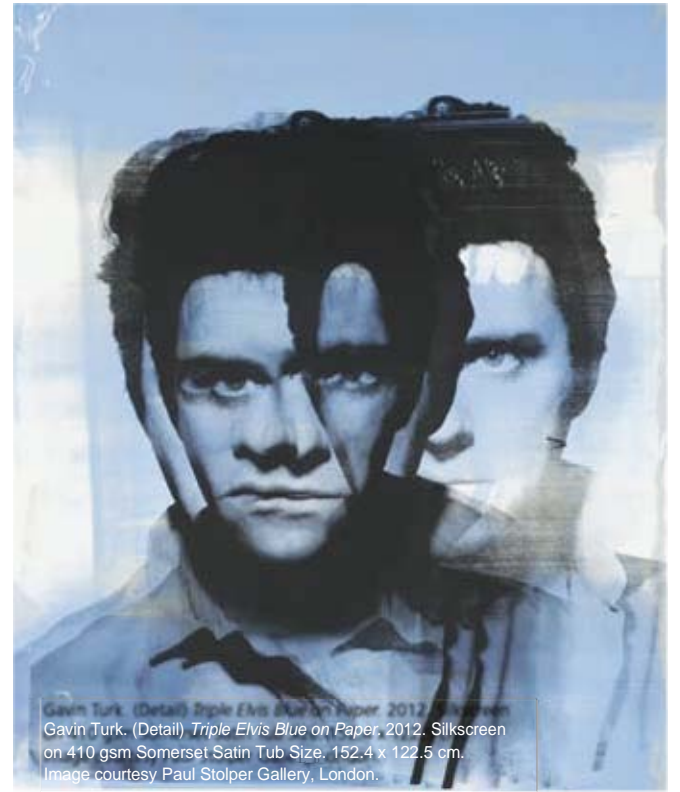
Gavin Turk. (Detail) Triple Elvis Blue on Paper, 2012. Silkscreen on 410 gsm Somerset Satin Tub Size. 152.4 x 122.5 cm.